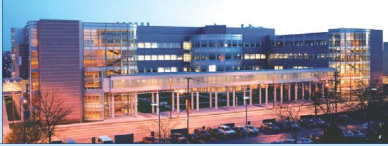
Lerner Research Institute