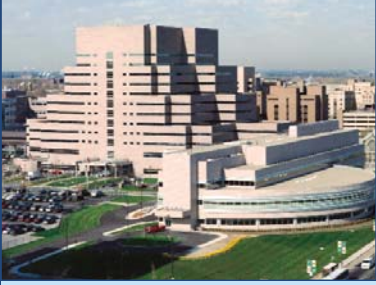
Crile Building and Cole Eye Institute