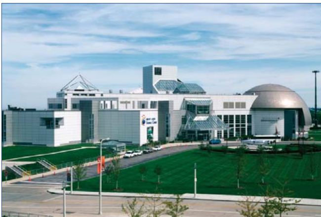
Great Lakes Science Center