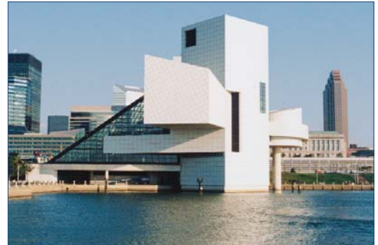
Rock and Roll Hall of Fame and Museum