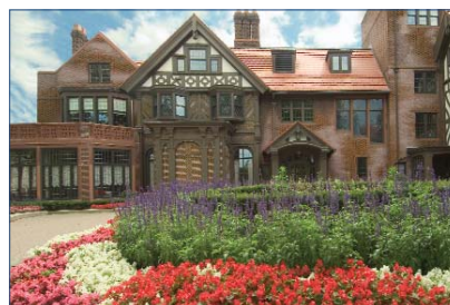
The Cleveland Clinic Foundation House