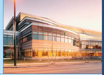
Taussig Cancer Center

The Cleveland Clinic is one of the nation's great hospitals and research centers. In 2006 the state-of-the-art medical center ranked 4th among the nation's best hospitals, according to U.S. News and World Report , with particularly high marks in otolaryngology, cardiology and heart surgery, digestive disorders, urology, and orthopedics. The not-for-profit, multispecialty academic institution emphasizes the importance of research and education in improving patient care, creating an atmosphere of innovation and excellence.