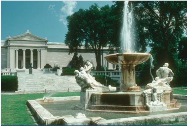
The Cleveland Museum of Art