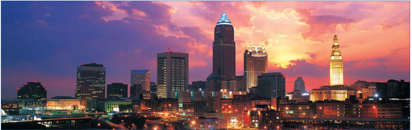
Cleveland Skyline