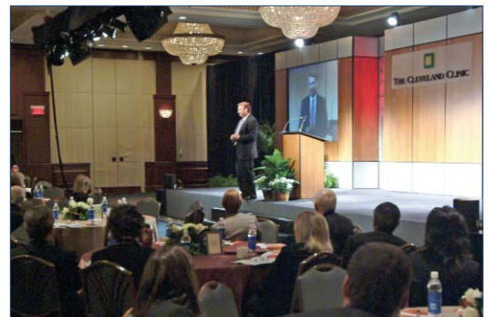
Ballroom, InterContinental Hotel