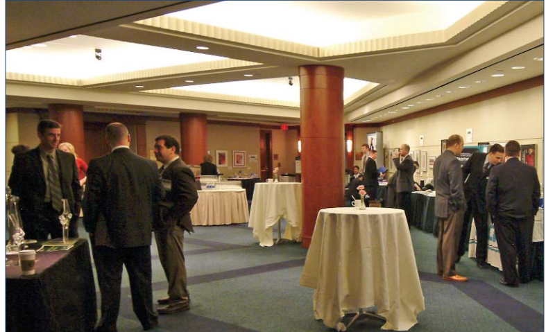
InterContinental Hotel 3 rd Floor Lobby

Exhibits of medical equipment, publications and pharmaceutical products will be held in conjunction with the Pulitzer Cleveland Meeting. Participants will have the opportunity to acquaint themselves with some of the latest innovations in otolaryngology and related medical science. Interested companies are advised to refer to the official website at www.pulitzercleveland.org and send an application form with payment to the Meeting Secretary by May 31, 2007.