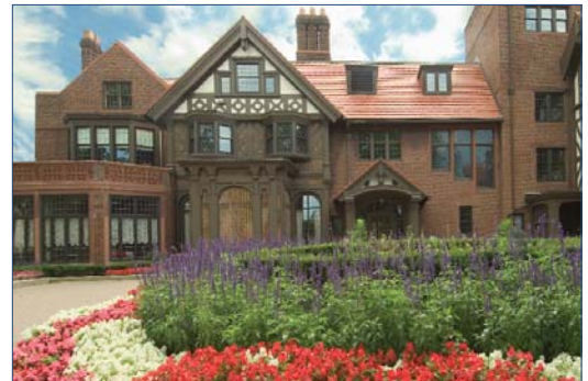
The Cleveland Clinic Foundation House