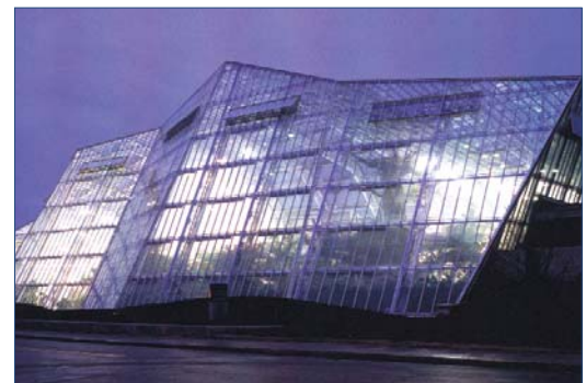
Cleveland Botanical Garden