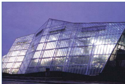
Cleveland Botanical Garden