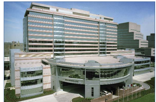
InterContinental Hotel and Bank of America Conference Center