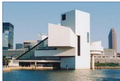
Rock and Roll Hall of Fame and Museum